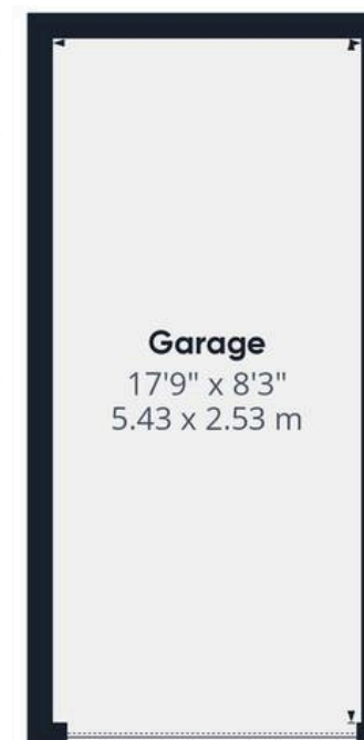
Floor 1 Building 2