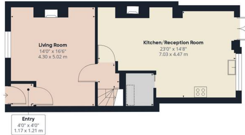
Floor 1 Building 1