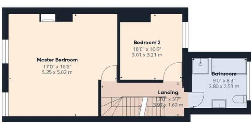
Floor 2 Building 1