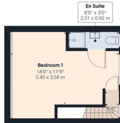
Floor 3 Building 1