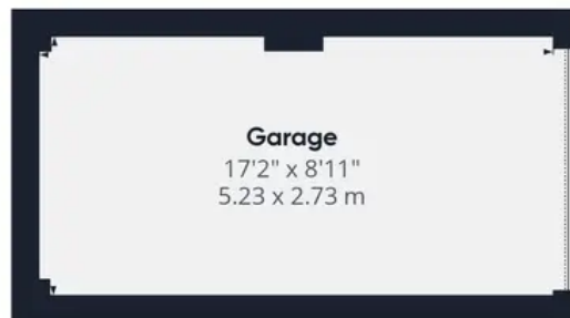
Floor 1 Building 2

Approximate total area (1) 1336.61 ft 2 124.18 m 2