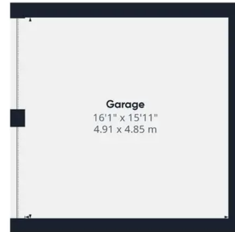
Floor 1 Building 2

Approximate total area (1) 928.85 ft 2 86.29 m 2