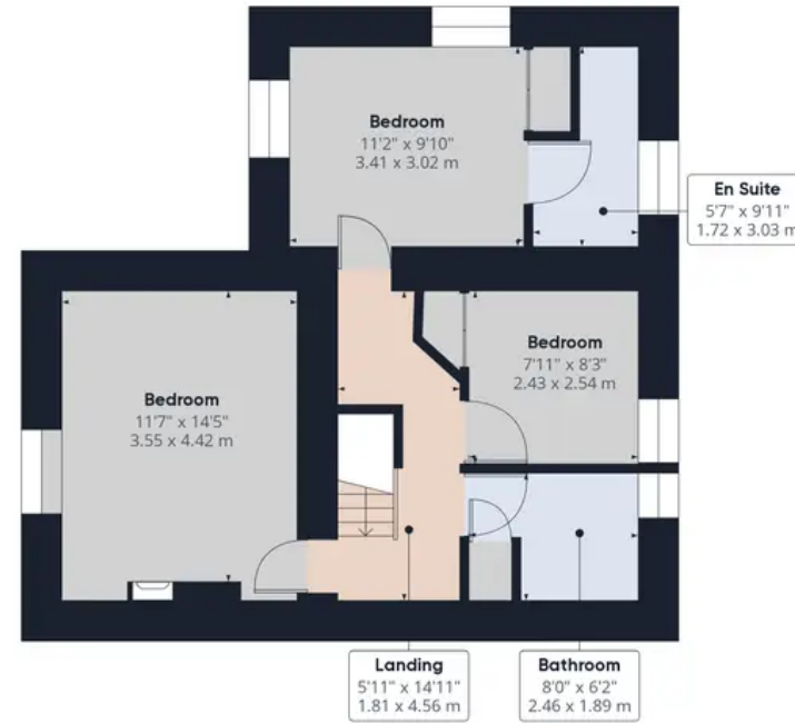
Floor 2 Building 1