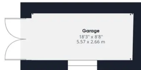
Floor 1 Building 2