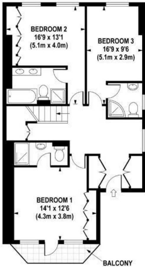
SECOND FLOOR GROSS INTERNAL FLOOR AREA 840 SQ FT