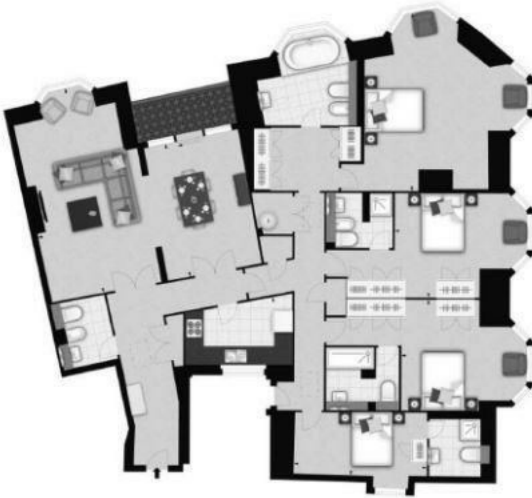
Illustration For Identification Only, Not to Scale All Calculations include Any/All Areas Under 1.5m Head Height * As Defined by RICS - Code of Measuring Practice

APPROX. GROSS INTERNAL AREA * 2135 Ft 2 - 198.34 M 2