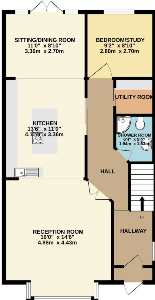
GROUND FLOOR 751 sq.ft. (69.7 sq.m.) approx.