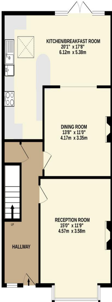
GROUND FLOOR 837 sq.ft. (77.8 sq.m.) approx.