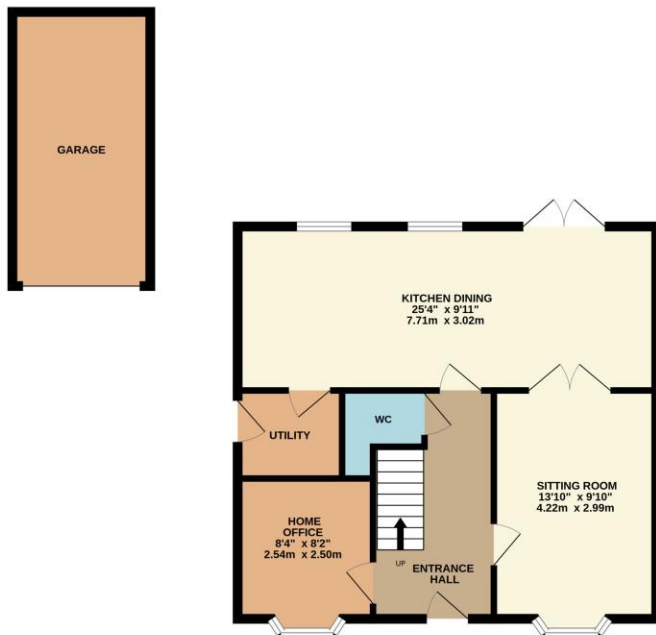
GROUND FLOOR 745 sq.ft. (69.2 sq.m.) approx.