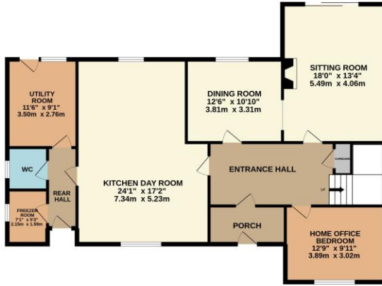
GROUND FLOOR 1724 sq.ft. (160.2 sq.m.) approx.