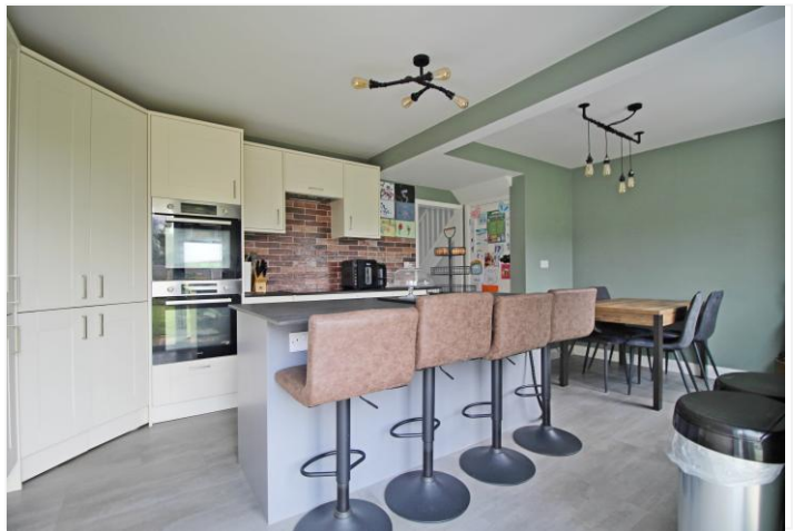
GODSEY LANE, MARKET DEEPING, PE6 8HT OFFERS IN EXCESS OF £300,000 FREEHOLD

A LOVELY THREE BEDROOM SET CLOSE TO AMENITIES, SCHOOLS & THE TOWN CENTRE, HAVING BEEN STRIPPED BACK TO THE BRICK WORK THROUGHOUT, A FULL REFURBISHMENT PROGRAMME HAS BEEN UNDERTAKEN TO CREATE A WONDERFUL LIVING ARRANGEMENT AND HOME, MUCH LOVED BY THE CURRENT OWNERS, BUT NOW READY FOR ITS NEXT CHAPTER