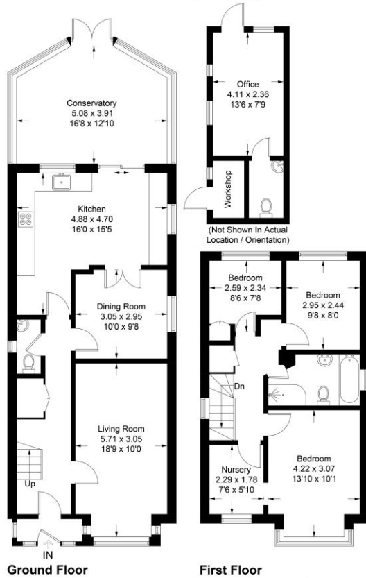
Ground Floor First Floor