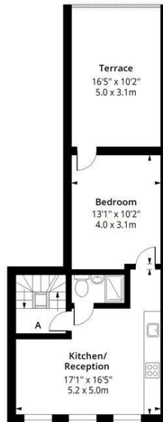
First Floor Floor Area 428 Sq Ft - 39.76 Sq M