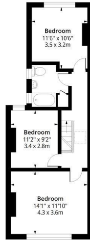
First Floor Floor Area 540 Sq Ft - 50.17 Sq M

Measured according to RICS IPMS2. Floor plan is for illustrative purposes only and is not to scale. Every attempt has been made to ensure the accuracy of the floor plan shown, however all measurements, fixtures, fittings and data shown are an approximate interpretation for illustrative purposes only. 1 sq m = 10.76 sq feet. Date: 23/11/2023 ipaplus.com