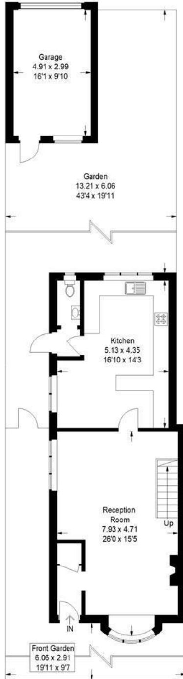
Ground Floor 655 sq ft / 60.9 sq m

Approximate Gross Internal Area 115.9 sq m / 1247 sq ft Garage = 14.9 sq m / 160 sq ft Total = 130.8 sq m / 1407 sq ft