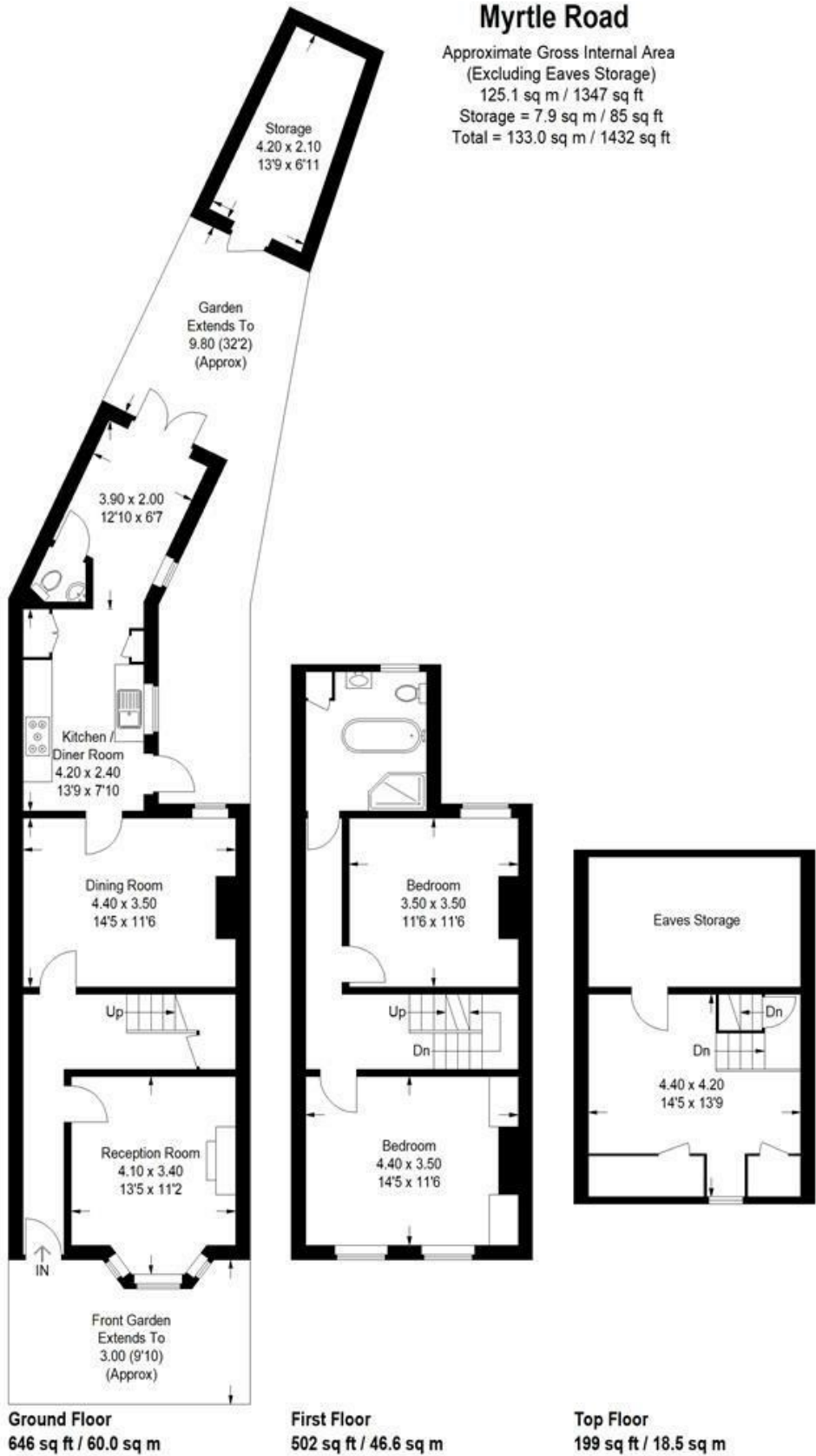
Illustration for identification purposes only, measurements are approximate, not to scale. FloorplansUsketch.com © 2023 (ID995673)

Approximate Gross Internal Area (Excluding Eaves Storage) 125.1 sq m / 1347 sq ft Storage = 7.9 sq m / 85 sq ft Total = 133.0 sq m / 1432 sq ft