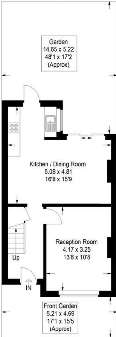
Ground Floor 446 sq ft / 41.5 sq m

Approximate Gross Internal Area = 77.5 sq m / 834 sq ft