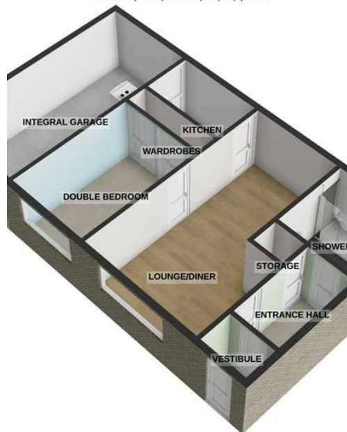
GROUND FLOOR 60.8 sq.m. (654 sq.ft.) approx.

for purposes only. Decorative finishes, fixtures, fittings and furniture shown are for illustrative purposes only. Measurements are approximate and based on current state of the property. Measurements are approximate. Made with Metropix © 2024