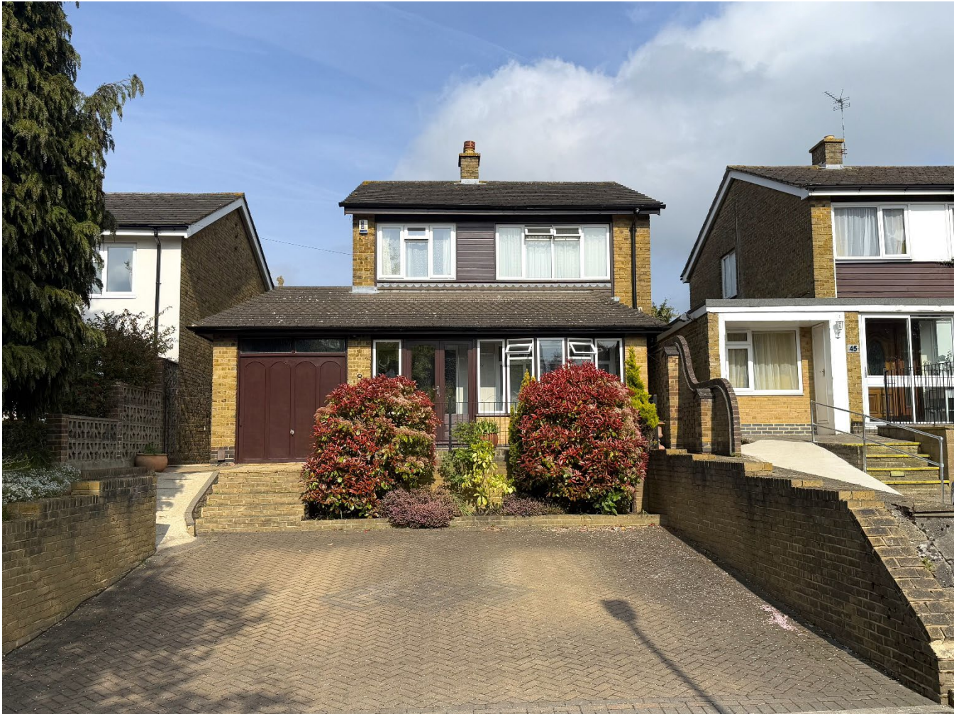
Chelsfield Lane | Orpington | BR5