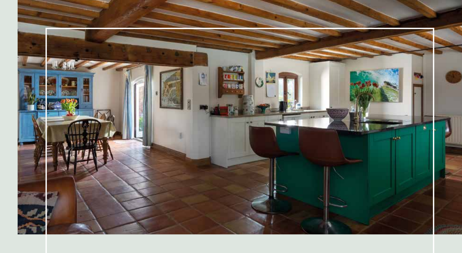
A KITCHEN MADE FOR GATHERING

The dining area comfortably seats 10 to 12 and benefits from French doors opening onto the rear terrace, allowing the room to spill into the garden in warmer months giving that indoors/outdoors feel. This is a space that works effortlessly from everyday family life to big celebratory lunches.