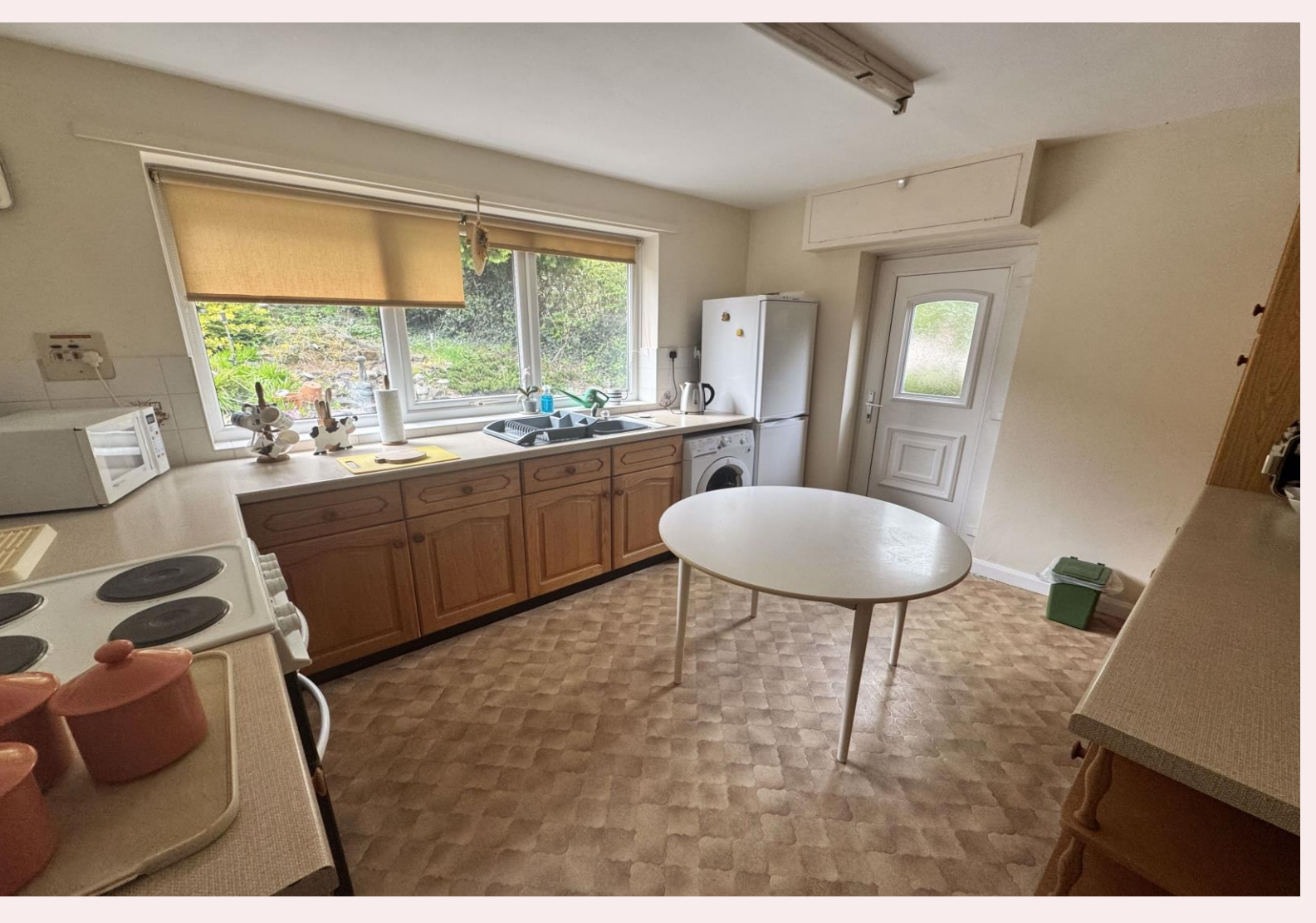
A detached bungalow in a sought after village location...