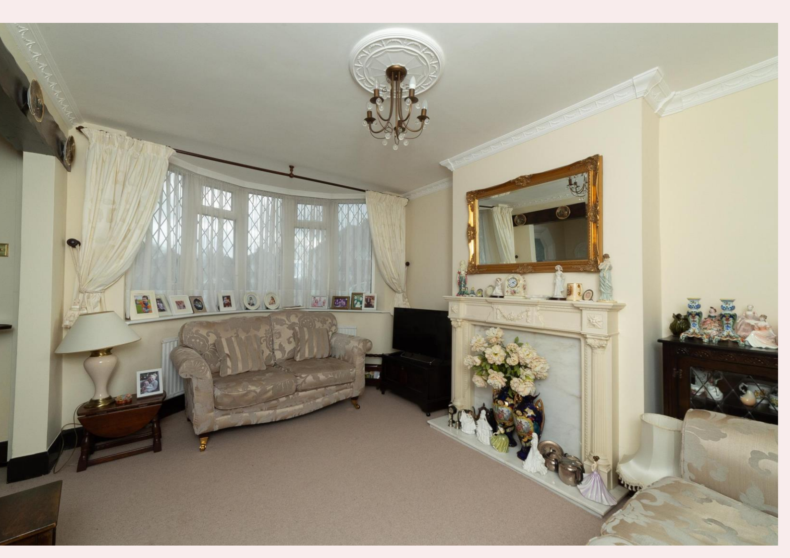
Your Forever Home...