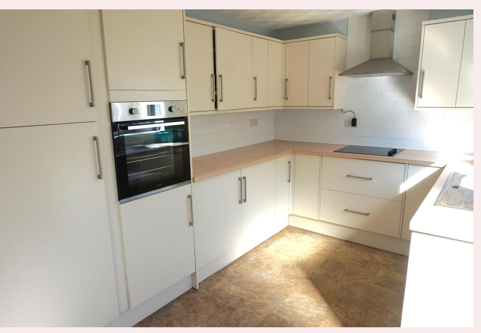
Location, Location, Location...