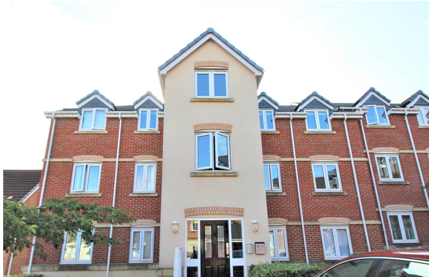
Trinity Road, Edwinstowe, NG21 9RW Monthly Rental Of £675