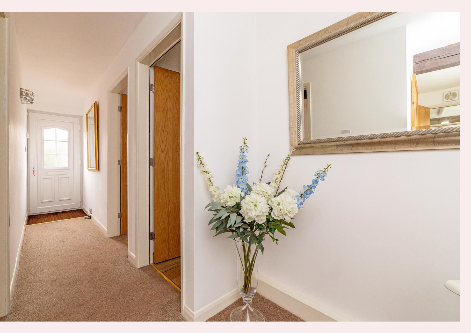
Oozing charm and character