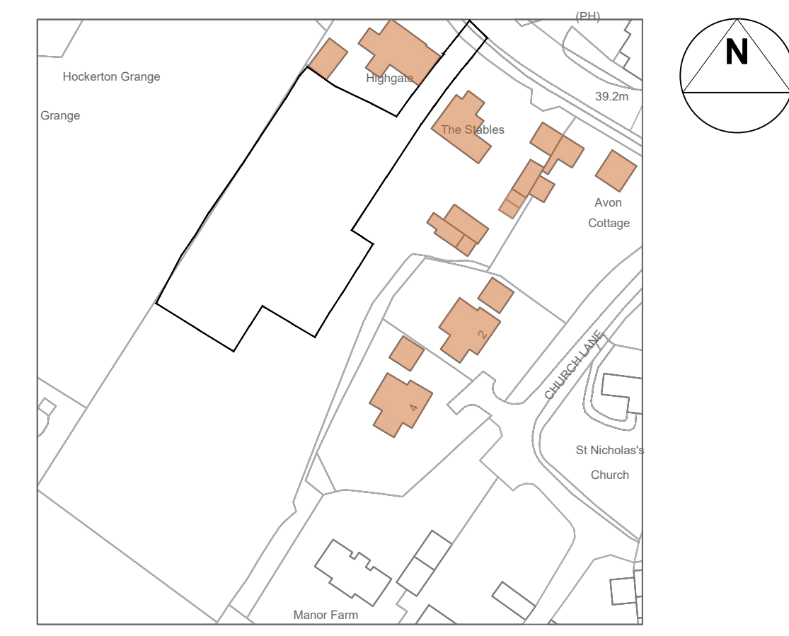
EXISTING SITE LOCATION PLAN SCALE 1:1250