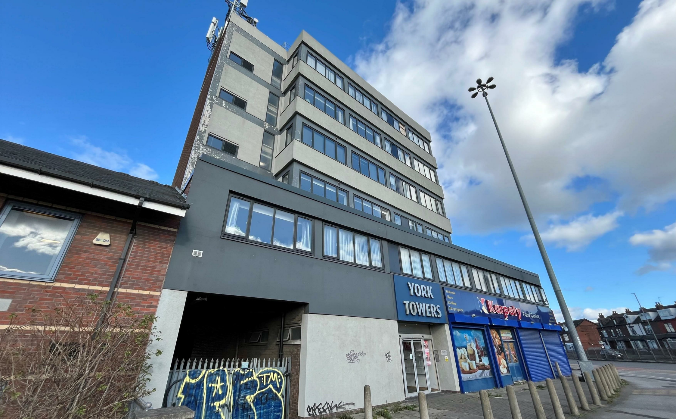
York Towers, York Road, Leeds Guide Price £50,000