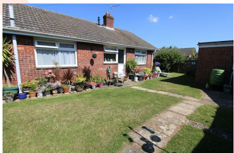
3 MAGDALEN CRESCENT, COWES, PO31 8EP