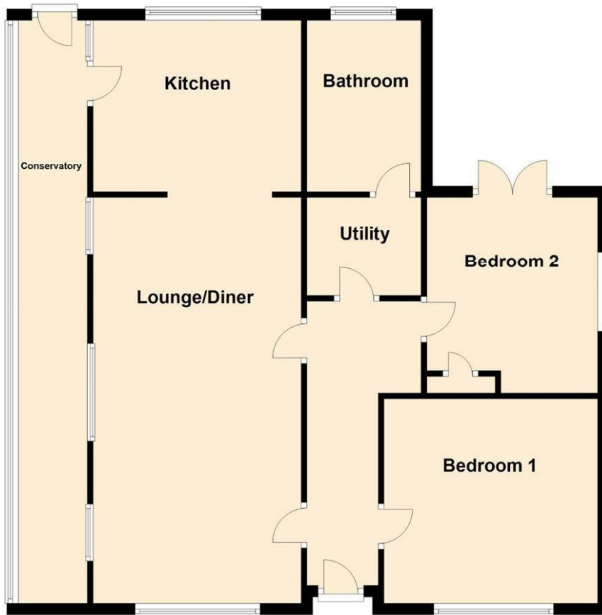
SKETCH PLAN FOR ILLUSTRATIVE PURPOSES ONLY! All measurements are approximate. Plan produced using PlanUp.