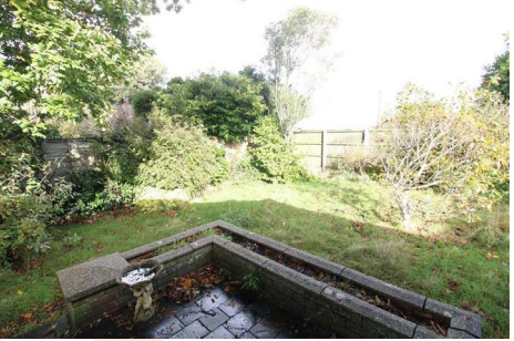
193 PARK ROAD, COWES, PO31 7NP