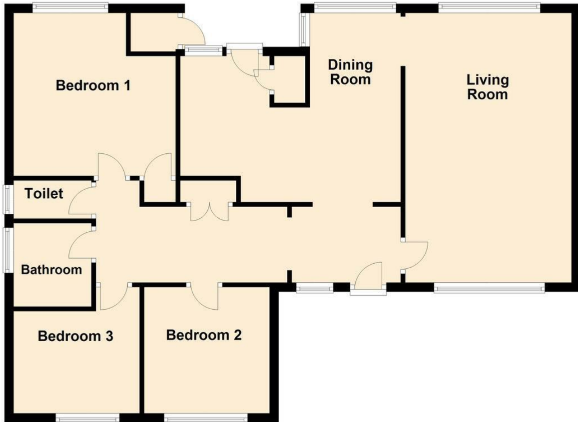
SKETCH PLAN FOR ILLUSTRATIVE PURPOSES ONLY All measurements are approximate. Plan produced using PlanUp.