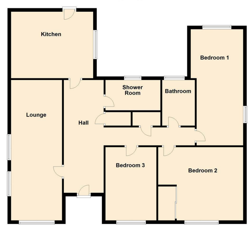
SKETCH PLAN FOR ILLUSTRATIVE PURPOSES ONLYAll measurments are approximate. Plan produced using PlanUp.