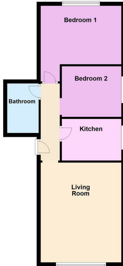
SKETCH PLAN FOR ILLUSTRATIVE PURPOSES ONLY All measurements are approximate. Plan produced using PlanUp.