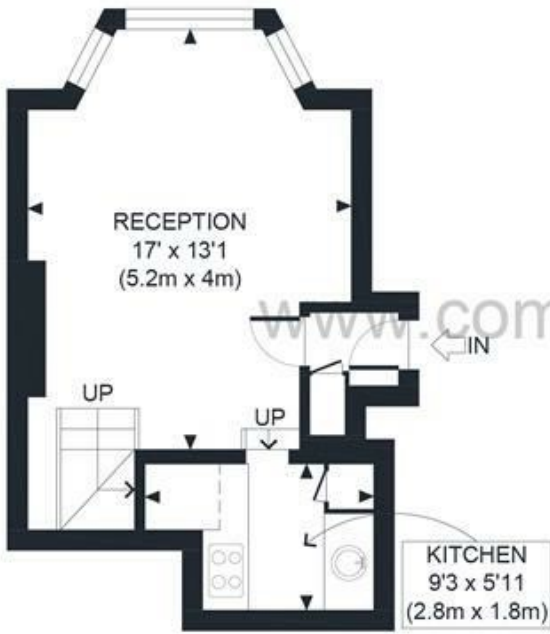
GROUND FLOOR GROSS INTERNAL FLOOR AREA 277 SQ FT