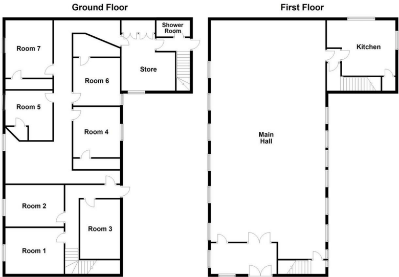
Not to scale. For illustrative purposes only

You may download, store and use the material for your own personal use and research. You may not republish, retransmit, redistribute or otherwise make the material available to any party or make the same available on any website, online service or bulletin board of your own or of any other party or make the same available in hard copy or in any other media without the website owner's express prior written consent. The website owner's copyright must remain on all reproductions of material taken from this website.