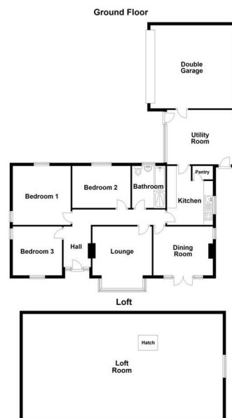
Not to scale. For illustrative purposes only

You may download, store and use the material for your own personal use and research. You may not republish, retransmit, redistribute or otherwise make the material available to any party or make the same available on any website, online service or bulletin board of your own or of any other party or make the same available in hard copy or in any other media without the website owner's express prior written consent. The website owner's copyright must remain on all reproductions of material taken from this website.