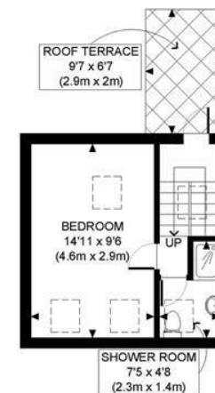
THIRD FLOOR GROSS INTERNAL FLOOR AREA 218 SQ FT

APPROX. GROSS INTERNAL FLOOR AREA: 1224 SQ FT/ 114 SQM