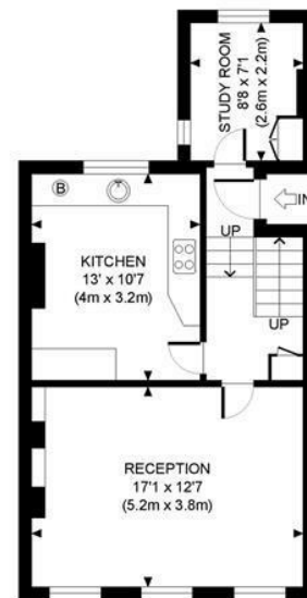
FIRST FLOOR GROSS INTERNAL FLOOR AREA 496 SQ FT