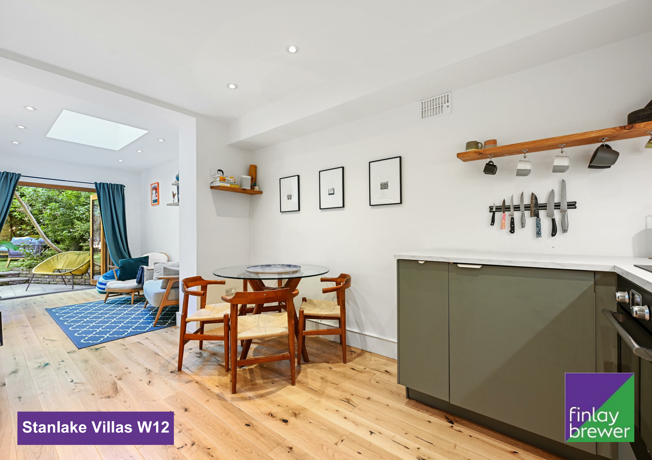
Stanlake Villas W12