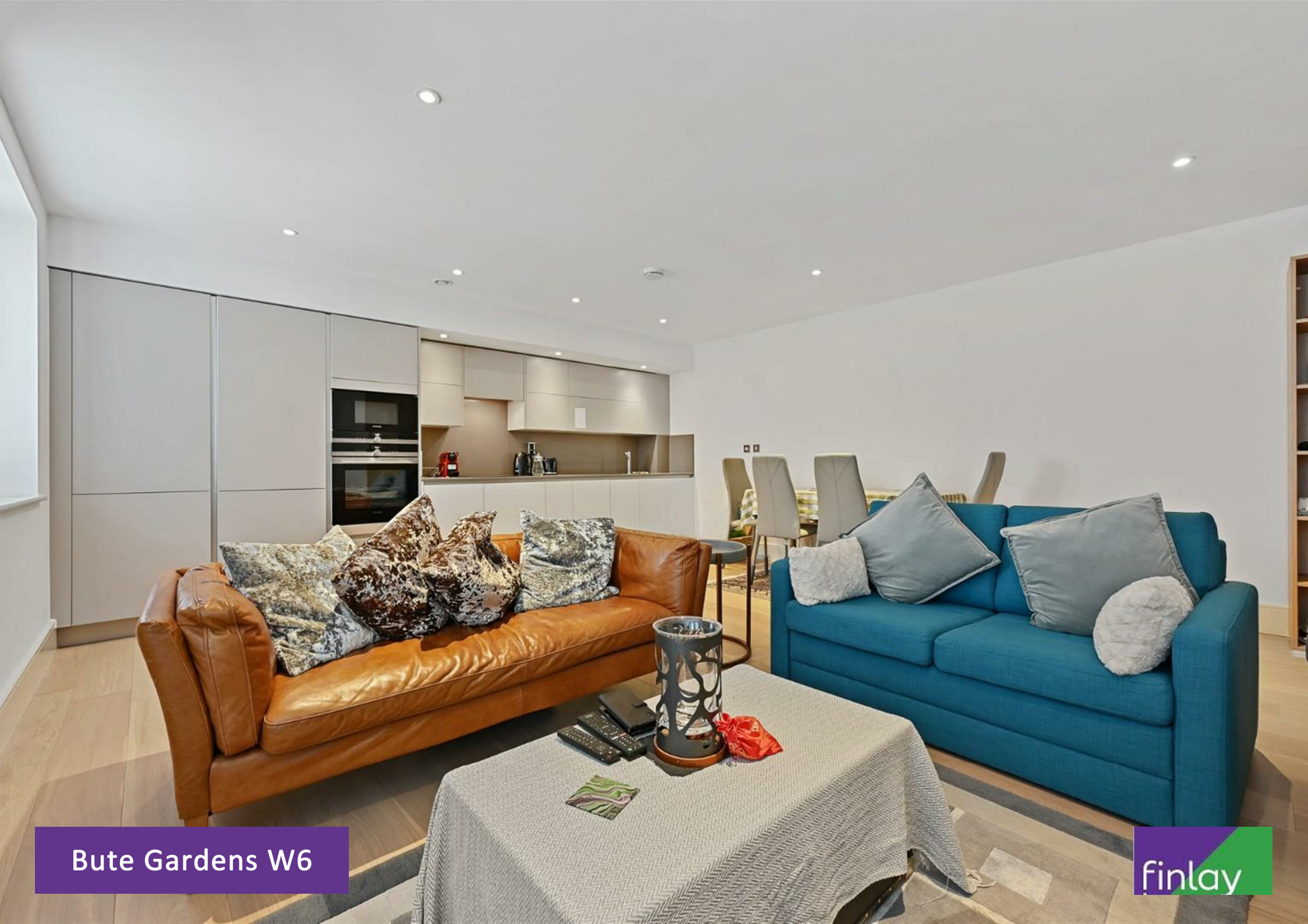
Bute Gardens W6