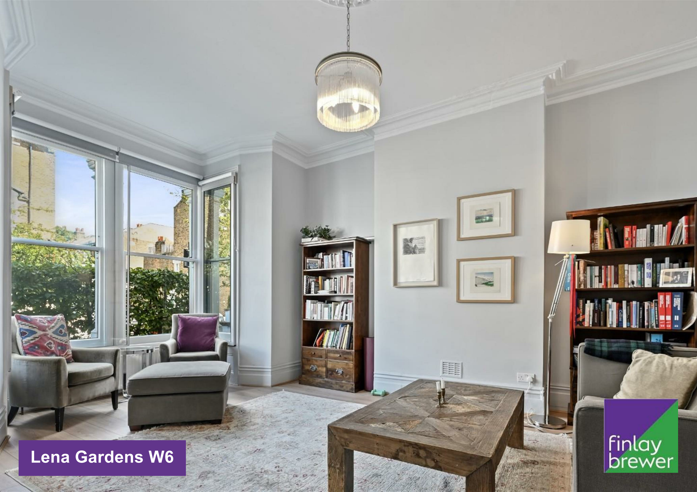
Lena Gardens W6