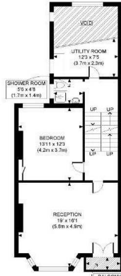
FIRST FLOOR GROSS INTERNAL FLOOR AREA 701 SQ FT