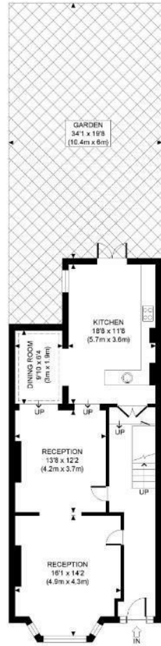
GROUND FLOOR GROSS INTERNAL FLOOR AREA 844 SQ FT