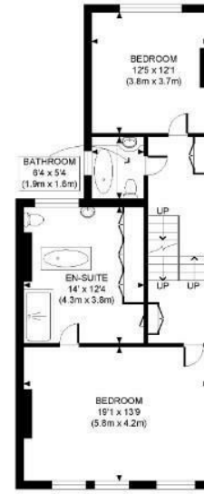
SECOND FLOOR GROSS INTERNAL FLOOR AREA 779 SQ FT

APPROX. GROSS INTERNAL FLOOR AREA WITH EAVES STORAGE: 3129 SQ FT/ 291 SQM APPROX. GROSS INTERNAL FLOOR AREA WITHOUT EAVES STORAGE: 2839 SQ FT/ 273 SQM