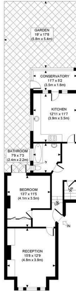
GROUND FLOOR GROSS INTERNAL FLOOR AREA 734 SQ FT

APPROX. GROSS INTERNAL FLOOR AREA WITH BASEMENT: 1231 SQFT/ 114 SQM APPROX. GROSS INTERNAL FLOOR AREA EXCLUDING BASEMENT: 734 SQFT/ 68 SQM