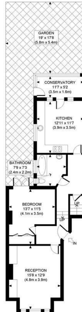
GROUND FLOOR GROSS INTERNAL FLOOR AREA 734 SQ FT

APPROX. GROSS INTERNAL FLOOR AREA: 1231 SQ FT/ 114 SQM