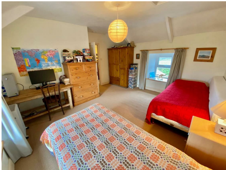
Bedroom 3 13'11 x 13'9 (4.24m x 4.19m)

Double glazed windows to sides with lovely views, access to loft, radiator.