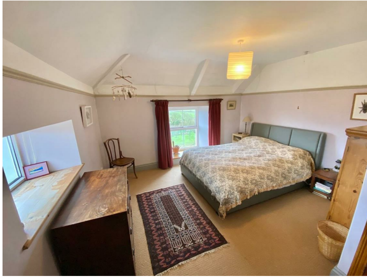
Bedroom 2 13'9 x 12'9 (4.19m x 3.89m)

Double glazed window to front and side with lovely views, built in wardrobe, radiator.