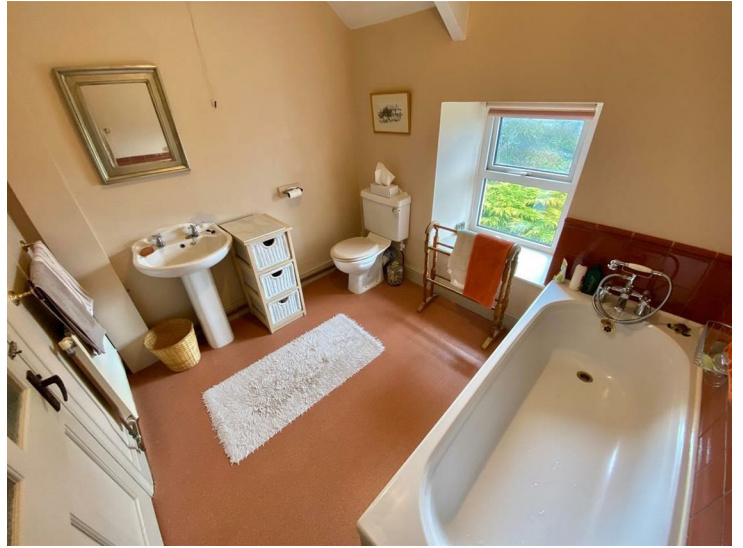
Bathroom 8'5 x 7'4 (2.57m x 2.24m)

Double glazed window to side with lovely views, bath with mixer shower over, pedestal wash hand basin, W.C, radiator, part tiled wall, electric wall heater.