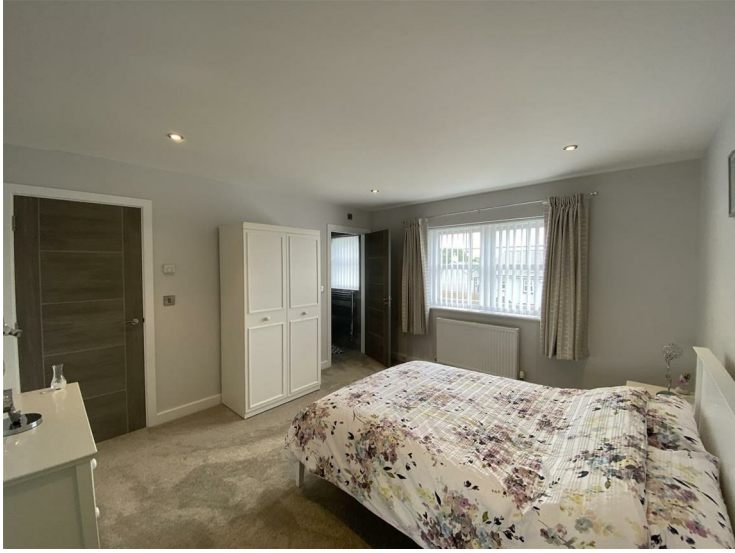
With uPVC window to the fore, fitted wardrobes