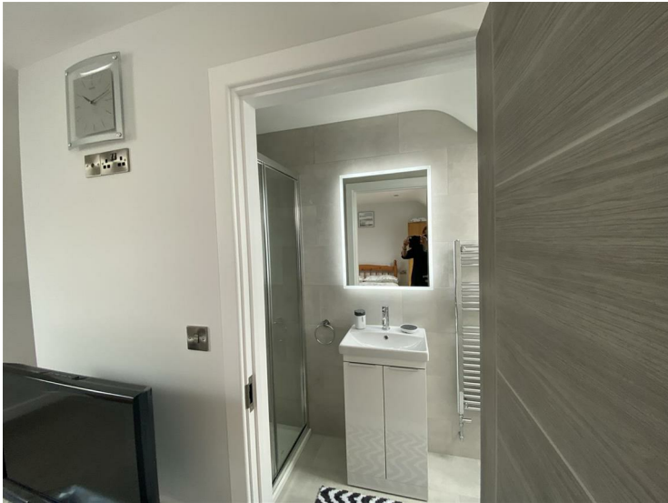
With Corner shower cubicle, wash hand basin and W.C.