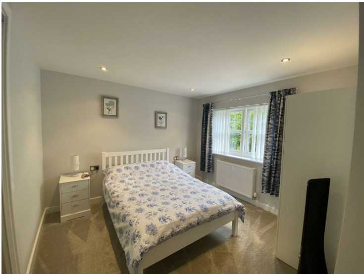
With uPVC window to the rear, fitted wardrobes