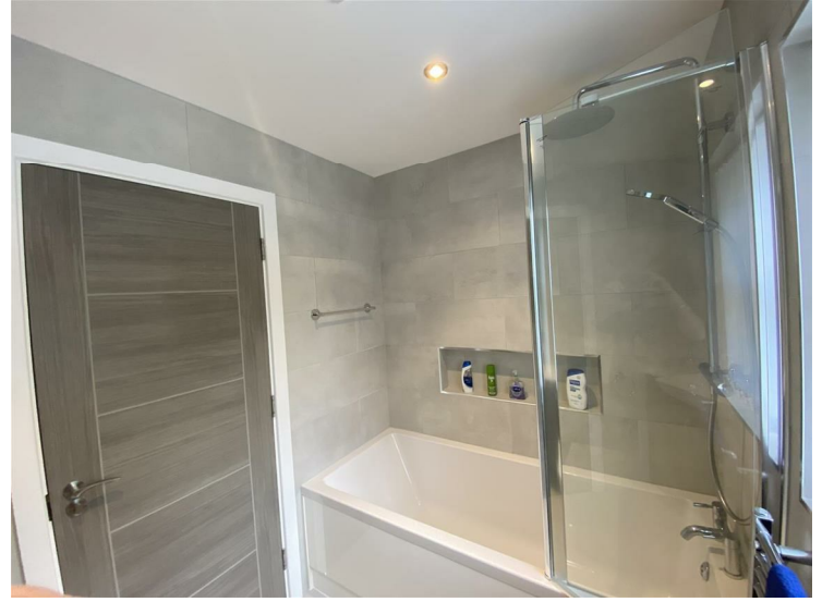
With uPVC window to the rear, Bath with Shower over, Wash hand basin, W.C. radiator style hand towel rail