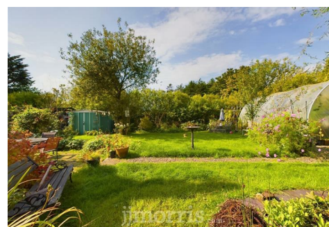
2 Duncan Terrace, Maenclochog, SA66 7LQ