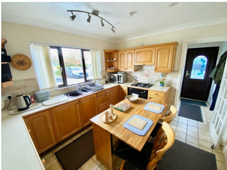
A well equipped kitchen/diner with a range of light oak

base units incorporating a 1 1/2 bowl sink unit with mixer tap integrated fridge and Diplomat Forum gas hob and Hygena electric oven with complementary worksurfaces over and with further storage in matching wall mounted units that include decorative corner displays and display cabinets. The walls are partly tiled and the window to the fore overlooks the front garden and there is a ceramic tiled floor which matches the utility room and side hallway. There are ceiling spotlights together with a centre light, radiator and kick plate heating and 15 pane glass door leads to utility. centre light, radiator.