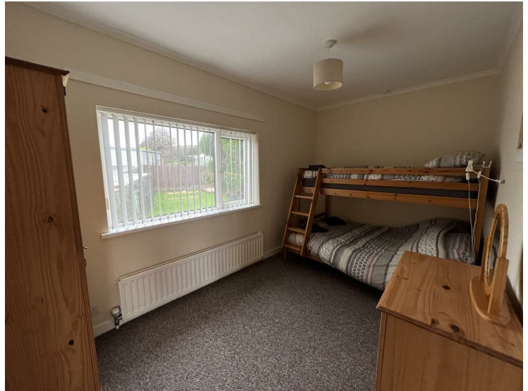
Overlooking the rear with radiator.