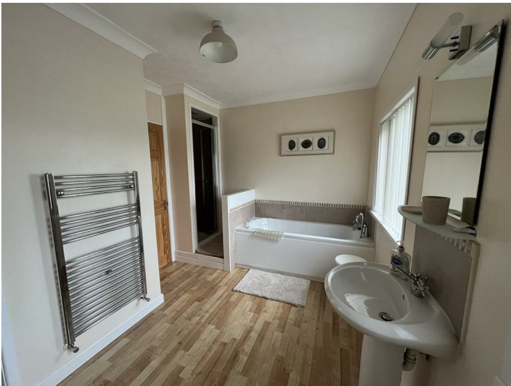
Comprising the usual 3 piece suite of W.C., wash hand

basin and bath with hand held shower attachment. A step ascends to a separate built in shower cubicle with 'Triton Cara' attachment, stainless steel heated towel rail. Access to a built in laundry cupboard which is shelved and houses the hot water cylinder. Laminated flooring and two windows to the rear.