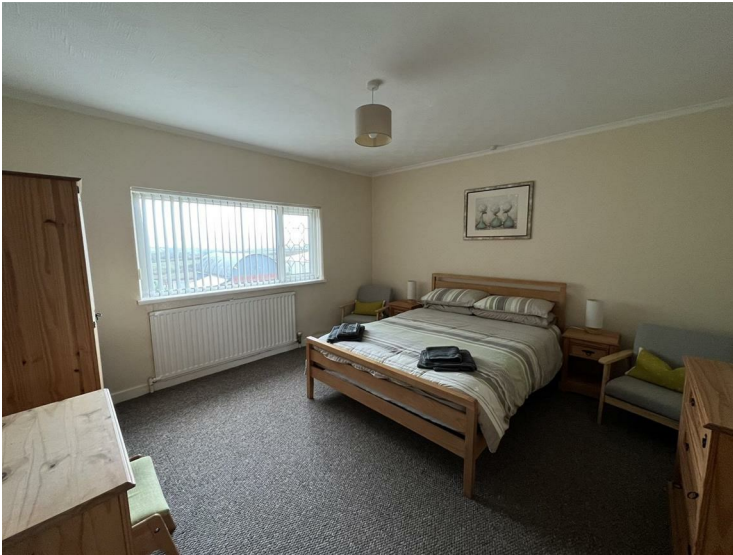
Overlooking the fore with radiator.