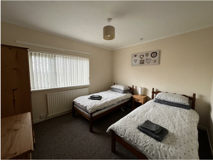
Overlooking the fore with radiator.