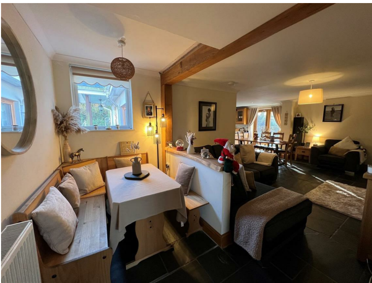
Open plan snug area 11'9" x 9'7" (3.58m x 2.92m)

The open plan living area also includes a lovely snug area which incorporates a second seating area with window to the side and access to: