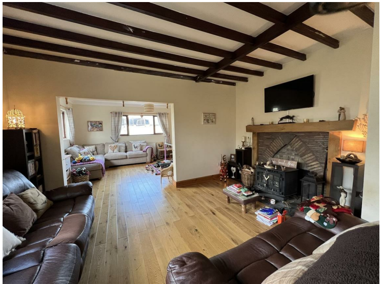
Sitting Room 17'5" x 15'8" (5.31m x 4.78m)

Overlooking the fore with timber flooring, radiator, stairs rise to the first floor whilst the main feature is the woodburning stove with brick surround and wooden mantel piece. Access to: