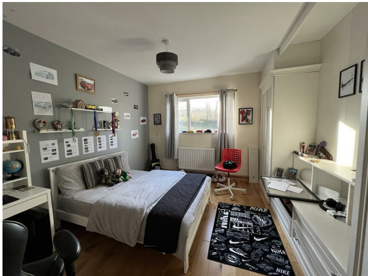
Overlooking the side with radiator, timber flooring and built in wardrobe.