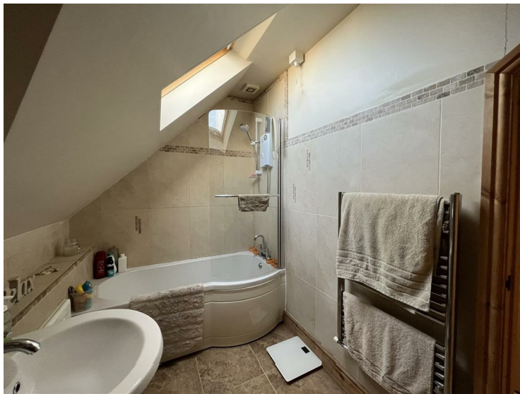
Family Bathroom 6'1" x 10'5" (1.85m x 3.18m)

Including a W.C., wash hand basin, bath with 'Mira Sport' attachment above, partly tiled walls, tiled floor, stainless steel heated towel rail and a small built in cupboard.