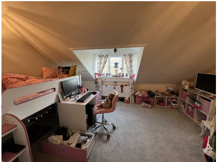
Overlooking the fore with radiator and sloped ceiling.