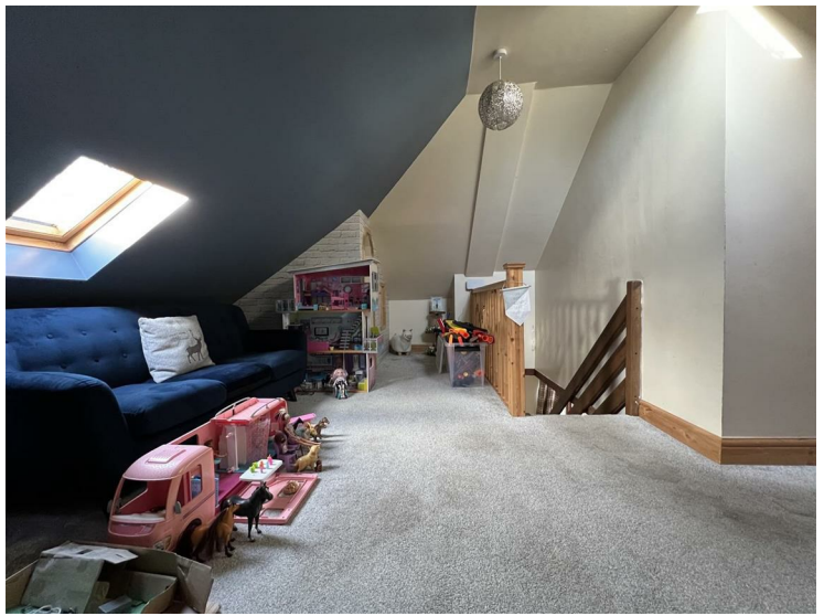
A very pleasant area which could be easily adapted into an office space including two 'Velux' windows and a built in children's den, access to: