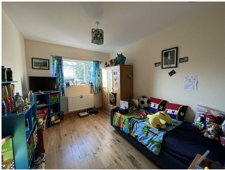
Overlooking the side with radiator and timber flooring.